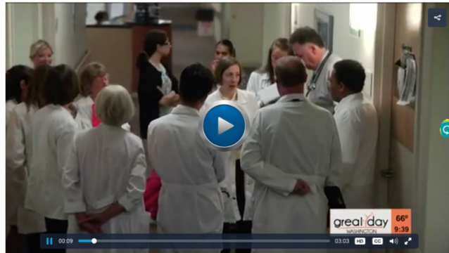
Friends of Patients at the NIH featured on Great Day Washington.